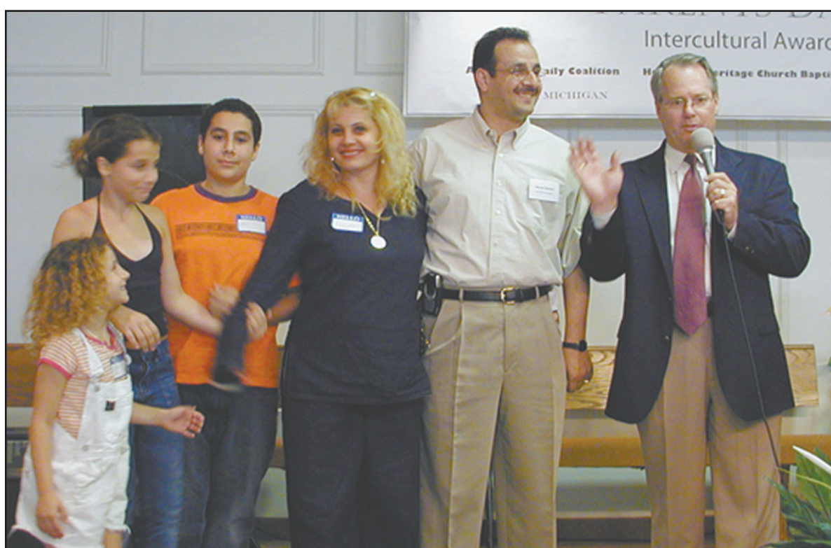
Each year exemplary parents are honored in communities across the nation such as this family in Michigan

The very first observance of Parents' Day (albeit a one-time only day of commemoration) was held on July 28, 1994 in a special recep-